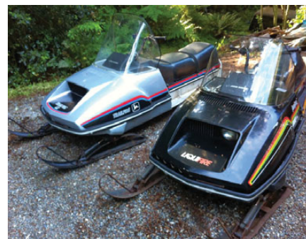
Do you have a couple of classics stashed away somewhere? Low snow years can be great for the classics! (Good snow years are fun for the vintage too of course!)

Like the other snowmobile clubs in Washington, we are anxiously waiting for snow, passing the time rushing to finish a project, or working on the last items on the sleds we want to ride. However, several of our members were also getting ready for when things go wrong. If you had not already guessed, that getting ready is avalanche training. You wouldn't think vintage snowmobiles can get into avalanche country, but the potential for avalanche is anywhere. A friend helped dig out a group of skiers who were buried while standing in a road cut.