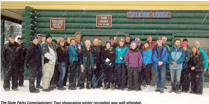
The State Parks Commissioners' Tour showcasing winter recreation was well attended.