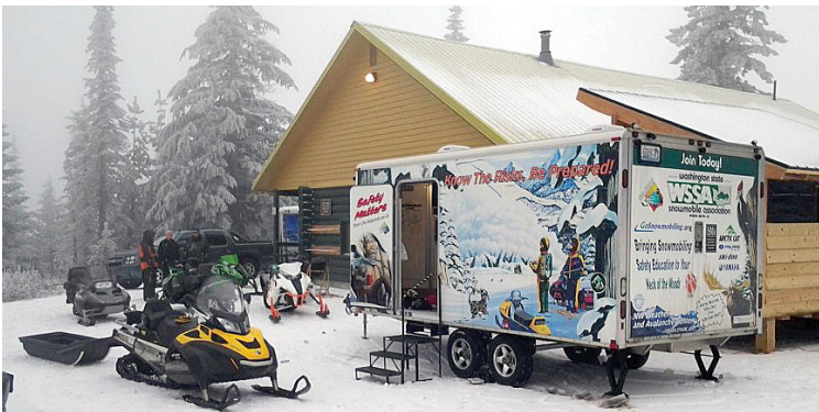
WSSA was on hand with our safety trailer. In addition to safety, we talked to attendees about snowmobiling on Mt. Spokane and around the state.