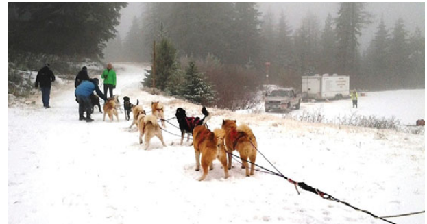
With lacking snow cover, sampling winter recreation was difficult. That being said, a short dog sled demonstration ride was provided.