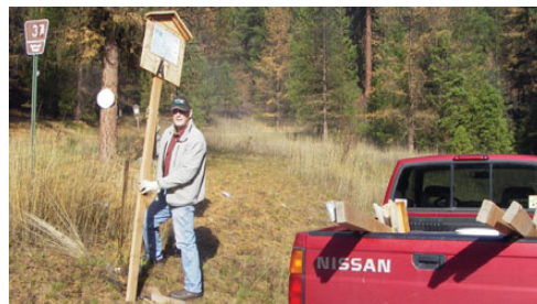
Tri-River club members hard at work installing signs on their local trail system.