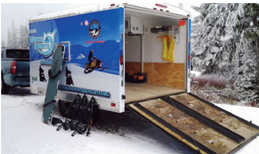
The Spokane Winter Knights took care of barbecuing hamburgers, hot dogs and salmon for our lunch. Their Search and Rescue trailer drew a lot of compliments.