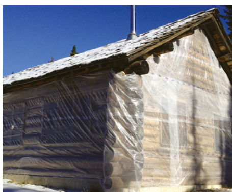
The CCC cabin at Mt. Spokane wrapped up until spring. Money is being donated to help with the restoration of this cabin.

As I write this, we are gearing up for our next event which will be the